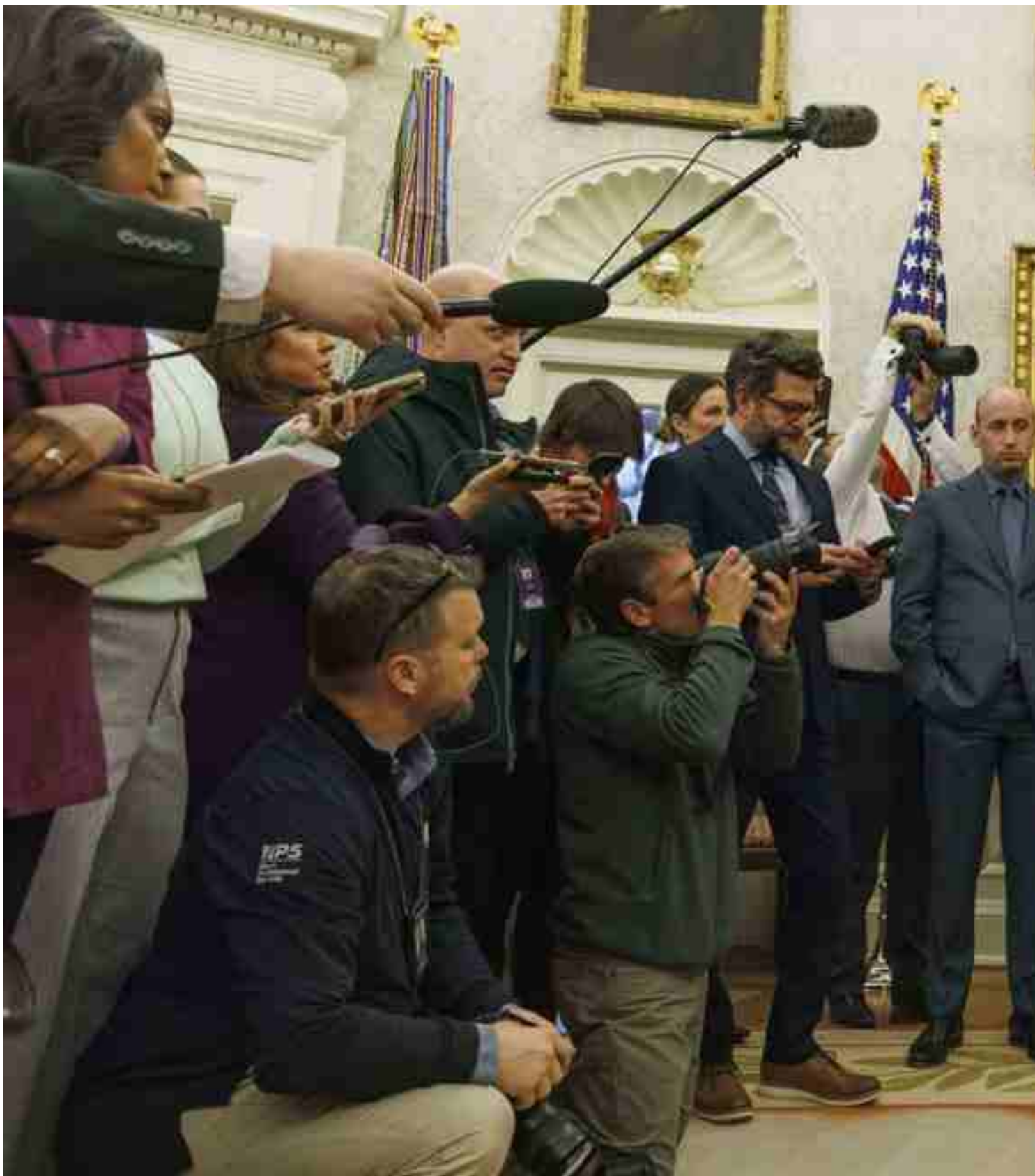
Musk in the Oval Office with his son X in February.