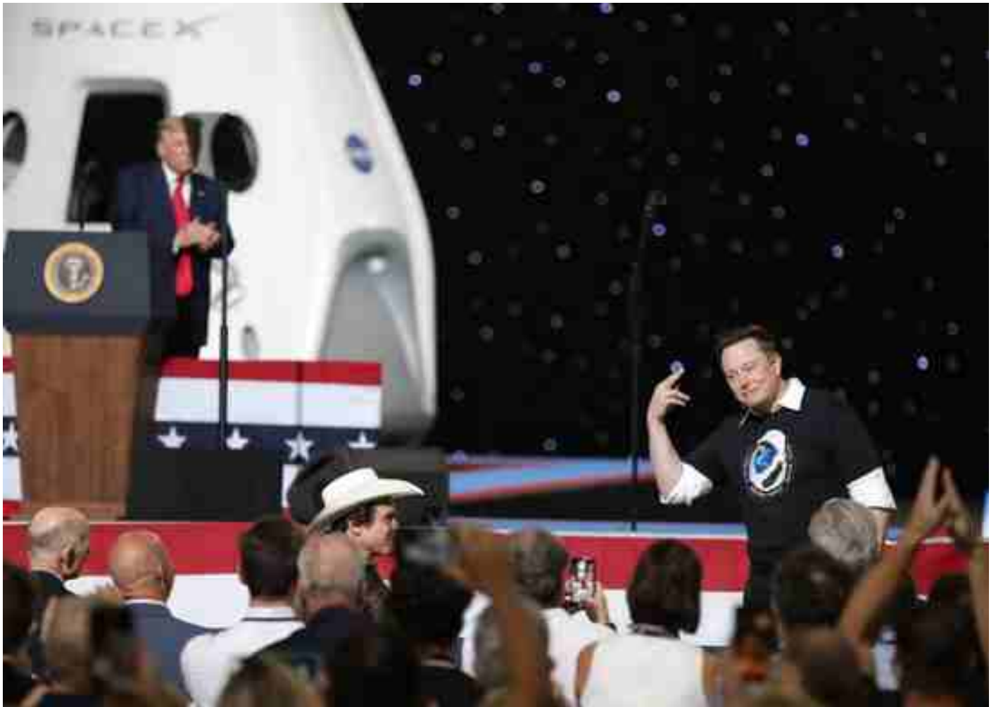
President Trump acknowledged Musk after SpaceX's successful crewed rocket launch in 2020.