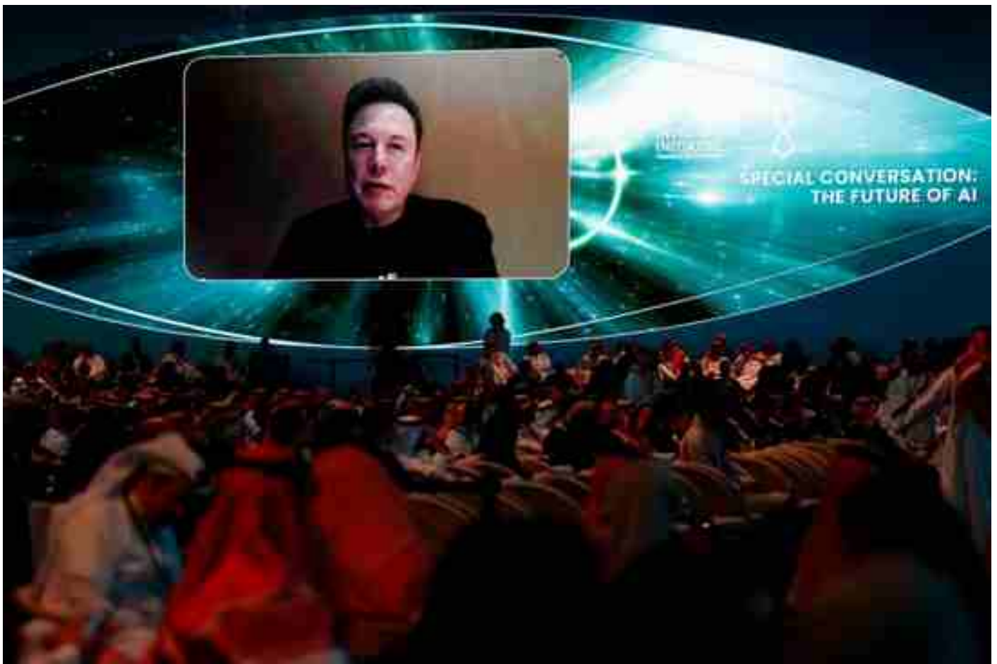
Musk on screen at an investment conference in Saudi Arabia in 2024.